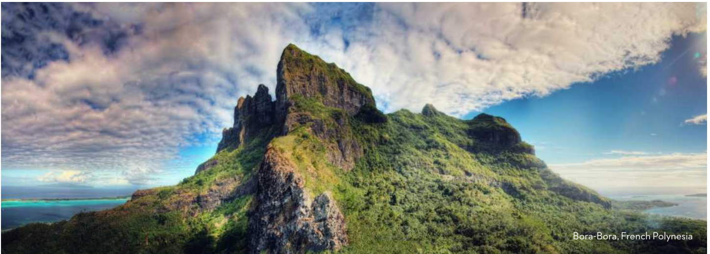
Bora-Bora, French Polynesia