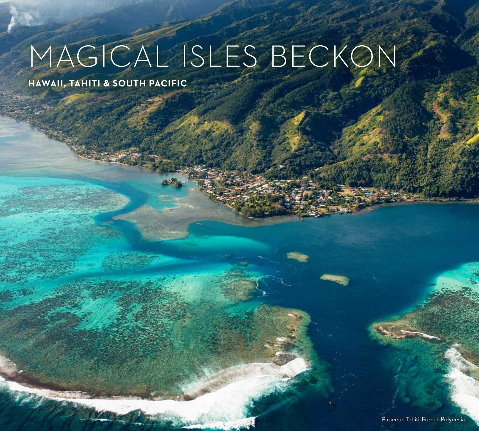
Papeete, Tahiti, French Polynesia