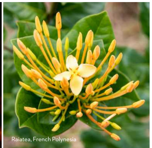
Raiatea, French Polynesia