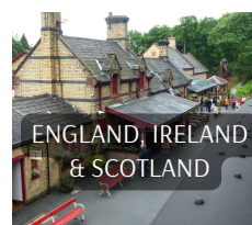
ENGLAND, IRELAND & SCOTLAND