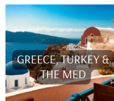
GREECE, TURKEY & THE MED