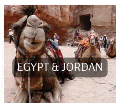
EGYPT & JORDAN