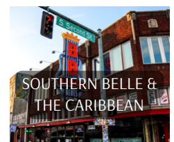
SOUTHERN BELLE & THE CARIBBEAN