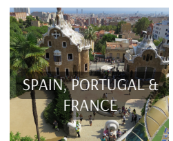
SPAIN, PORTUGAL & FRANCE