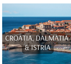
CROATIA, DALMATIA & ISTRIA