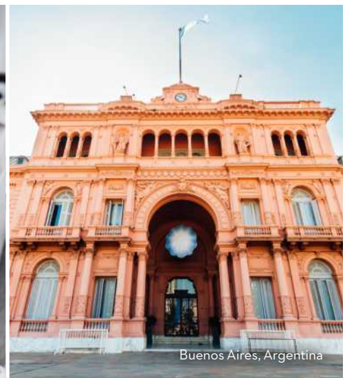
Buenos Aires, Argentina