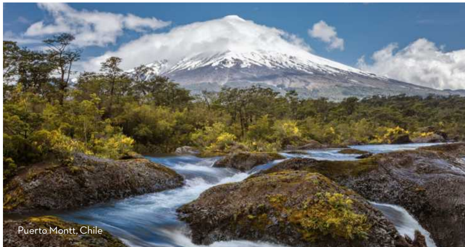
Puerto Montt, Chile

Change to arrangements may be subject to change charges.